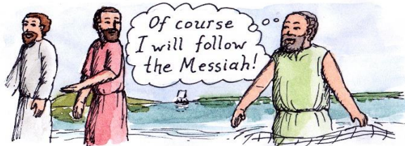
Answer to front page: We have found the Messiah! Answer to Cross-Word: his vocation. www.thekidsbulletin.com

God does not call all of us to very important jobs like the prophet Samuel and Saint Peter. But each of us should follow Jesus and be ready to do His will. If we always try to do what God wants, then we will be ready if He does have a special job for us! How can you do God's will today?