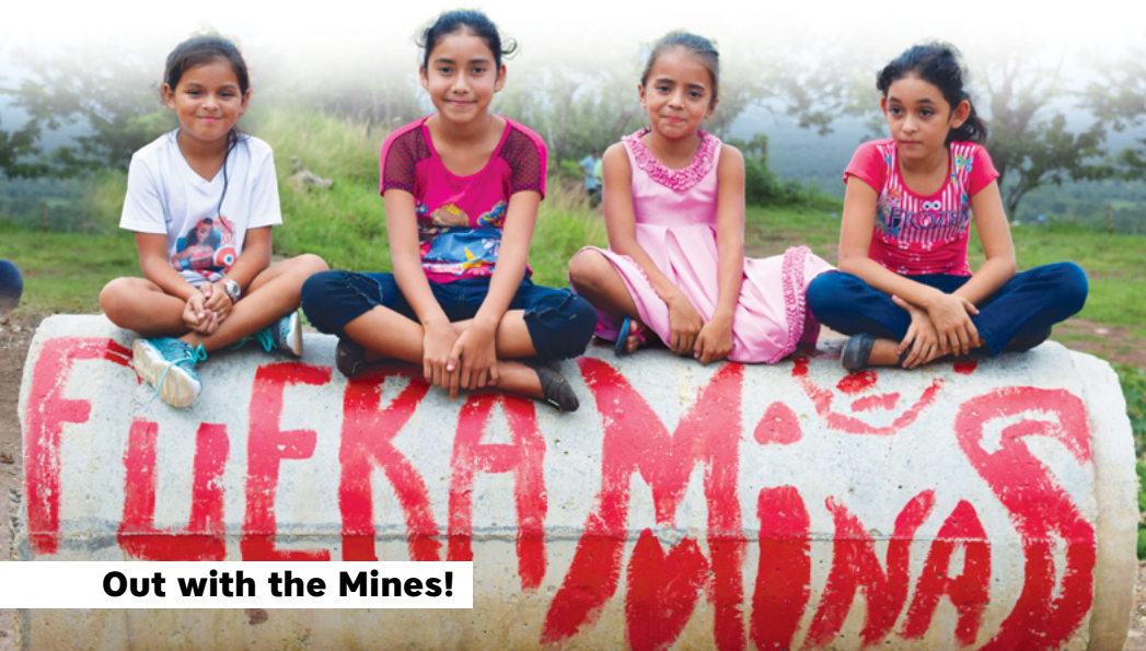
Out with the Mines!

Since January 2023, three defenders from Guapinol have been killed, adding to the heavy toll of more than 135 defenders murdered in Honduras since 2014.